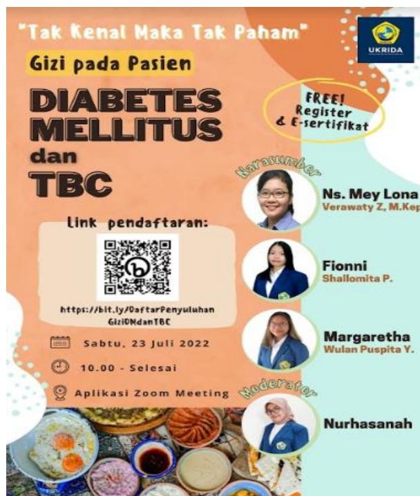
Figure 2. Community Service Activity Poster

"You don't know, so you don't understand: Nutrition in DM and TB patients". This title was determined based on a common phenomenon in society, lack of familiarity with two types of diseases which are unknowingly influenced by healthy behavior/lifestyle. The activity was attended by 34 participants from various regions, the participants were enthusiastic and took part in a series of pre and posttest activities, the third session of resource persons and giving door prizes and oral evaluation at the end of the event.