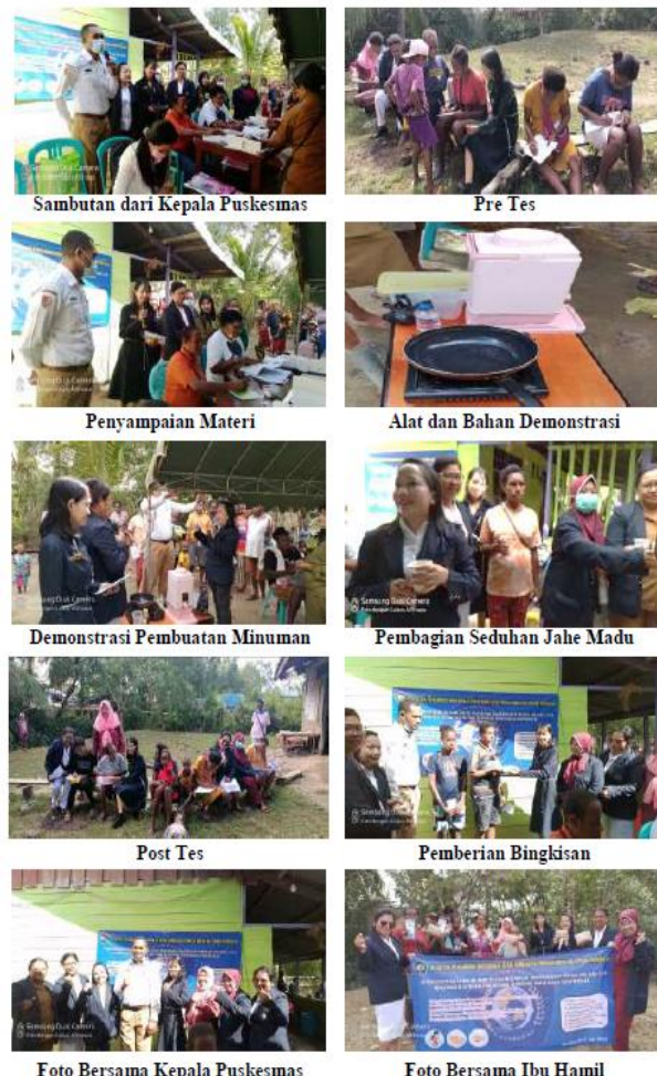
Picture 3. Service Documentation

This ginger honey drink is consumed twice a day in the morning and evening for 7 days. Through this activity, pregnant women can take advantage of the surrounding natural resources in an effort to reduce the incidence of anemia non-pharmacologically, especially at Posyandu Rose in the working area of the Karang Indah Community Health Center. This is evident from the recap of the questionnaire results before being given counseling as many as 13 pregnant women (57%) with Good knowledge and after being given counseling there was an increase in Good knowledge as many as 22 pregnant women (96%). This shows that participants are very enthusiastic about increasing their knowledge about the importance of education in dealing with pregnancy nausea and vomiting by utilizing the surrounding natural riches, namely ginger and honey drinks.